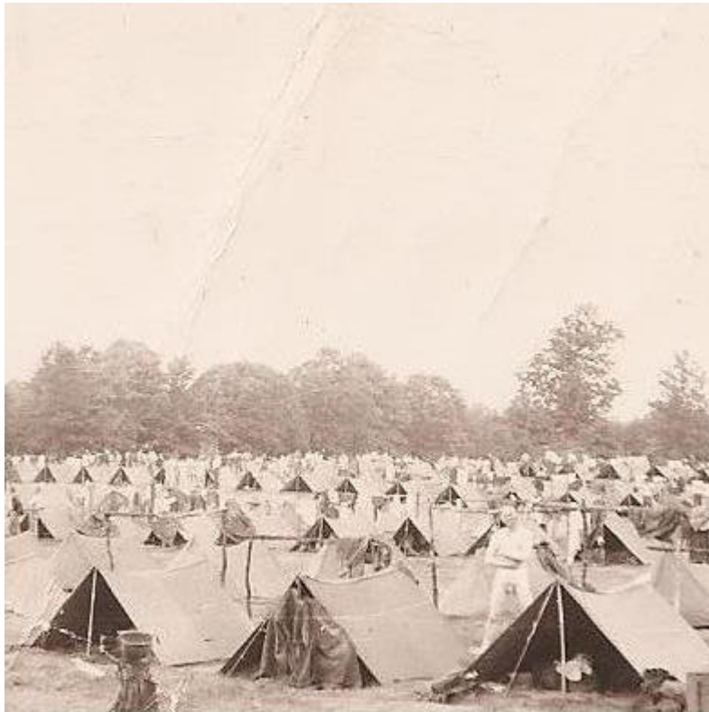
88 th Division was on maneuvers in Louisiana in 1943. This is what an army camp really looked like.