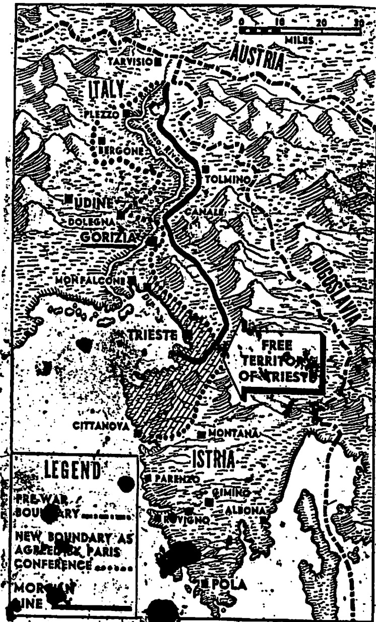
MAP PRINTED on July 15, 1946, in The Blue Devil, U. S. army newspaper published weekly by the 88th Division, which guards the temporary frontier of Venezia Giulia. Note how the Yugoslav border will envelop Gorizia, strategic bridgehead at the Isonzo River, if Italian peace treaty drafted at Paris is ratified.